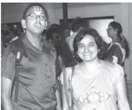
Rasika T A Ramanathan from Tirupur snapped this photo in the lobby of the Music Academy and captioned it - 'Modern and tradition, swapped of course'.